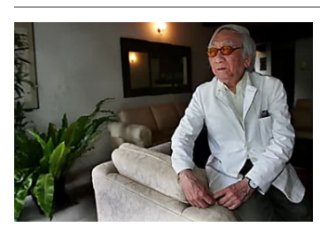
Singapore loses pioneer architect Aug 03, 2021