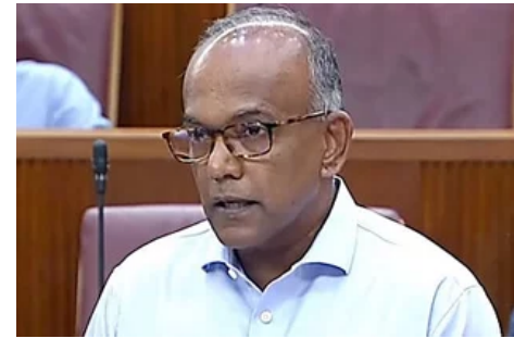
Government removed boyfriend/girlfriend category July 27, 2021