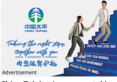
China Taiping Insurance, taking the right steps with you sg.cntaiping.com