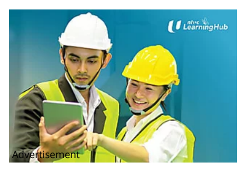
Your One-Stop Service Provider for WSH Consultancy NTUC Learninghub